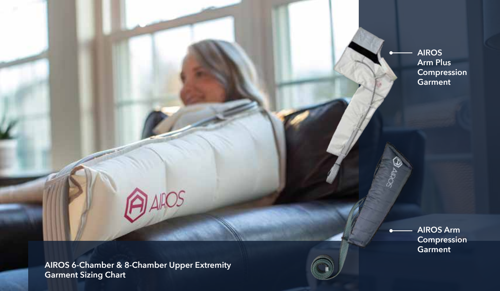
AIROS Arm Plus Compression Garment